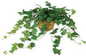
1506 - Ivy - Live, 6" Pot