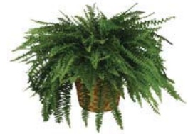
1505 - Ferns Floor or Hanging