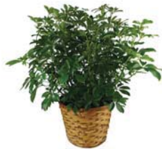
Schefflera Available sizes: 1507 - 2 - 3 ft. in 8" Pot 1509 - 3 - 4 ft. in 10" Pot