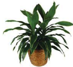
Warneckii Available sizes: 1507 - 2 - 3 ft. in 8" Pot 1509 - 3 - 4 ft. in 10" Pot