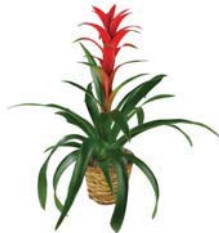
1502 - Bromeliads