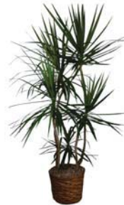
Dracena Available sizes: 1511 - 5 - 6 ft. in 10" Pot 1513 - 6 + ft. in 12" Pot