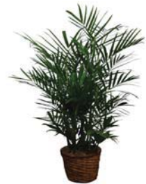
Palm Available sizes: 1511 - 5 - 6 ft. in 10" Pot 1513 - 6 + ft. in 12" Pot