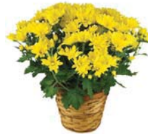
1503 - Chrysanthemums