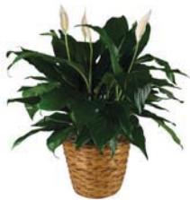
Peace Lily Available sizes: 1507 - 2 - 3 ft. in 8" Pot 1509 - 3 - 4 ft. in 10" Pot