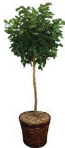
Ficus Available sizes: 1511 - 5 - 6 ft. in 10" Pot 1513 - 6 + ft. in 12" Pot