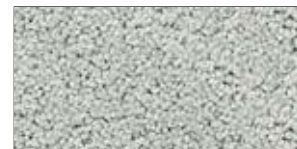
Silver Cloud (70)