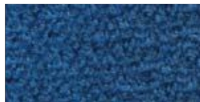
Royal Blue (06)