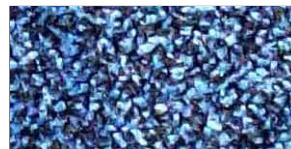
Blue Jay (92)