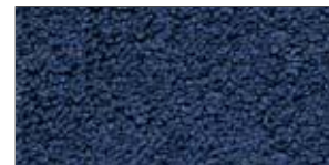
Deep Navy (72)