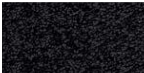
Onyx Black (47)