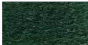
Hunter Green (42)