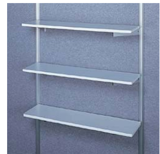
4071 - Display Shelf, White (1M x 12" deep)