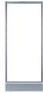
4021 - 1M x 8' Room Wall Panel 4022 - 1M Locking Door Unit