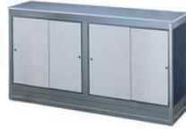
4044 - 2M x 1/2M x 40" Cabinet w/locking doors