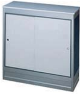
4043 - 1M x 1/2M x 40" Cabinet w/locking doors