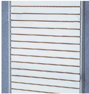
4094 - Slatwall Panel upgrade 1M x 8'