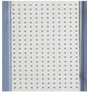
4091 - Pegboard Panel upgrade 1M x 8'