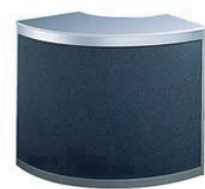
4041 - 1M x 40" Curved Counter (open back)