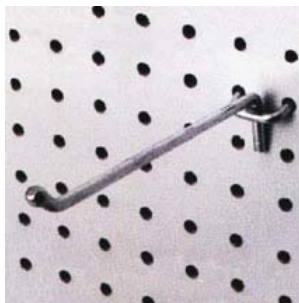
4077 - Pegboard Hook Call for sizes and availability