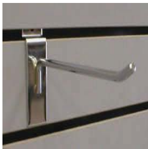
4078 - Slatwall Hook Call for sizes and availability