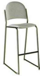
131- Stool, Padded