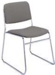
103- Padded Side Chair