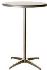
216 - Pedestal Table, 30" Diameter x 40" High