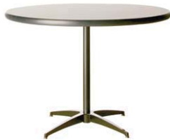
210 - Pedestal Table, 36" Diameter x 30" High