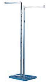
409 - Bag Stand