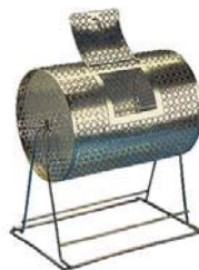
Ticket Tumbler, 2615 - Small, Table Top 2617 - Medium, Table Top (Call for availability & pricing)