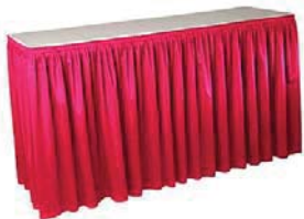
239 - 6' x 40" ht. Skirted Table Your choice of skirt color from available colors below