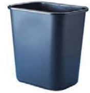
401 - Wastebasket w/liner