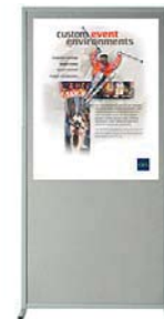
603 - Bulletin Board, 4'x8' Horizontal or Vertical

Colors may vary due to printing limitations and dye lot differences. Some items may differ in style than those pictured. See order form for additional offerings not pictured.