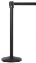
439 - Retractable Stanchion