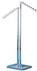
408 - Waterfall Stand