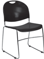
101 - Plastic Side Chair