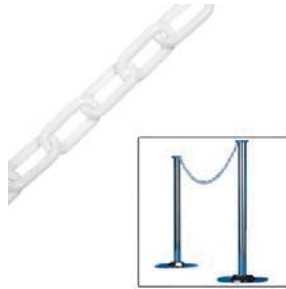
437 - Stanchion Chain White Plastic, Per In/ft