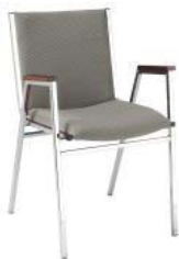
105 - Walnut Arm Chair