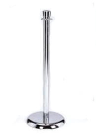
435 - Chrome Stanchion (chain not included)