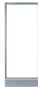
4021 - 1M x 8' Room Wall Panel 4022 - 1M Locking Door Unit