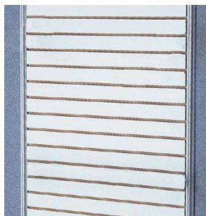
4094 - Slatwall Panel upgrade 1M x 8'