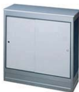
4043 - 1M x 1/2M x 40" Cabinet w/locking doors